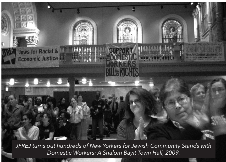
JFREJ turns out hundreds of New Yorkers for Jewish Community Stands with Domestic Workers: A Shalom Bayit Town Hall, 2009.

In 2002, DWU approached JFREJ with a visionary request: to organize Jewish employers to improve their employment practices and support the campaign for the New York Domestic Worker Bill of Rights. There was no roadmap to organize this constituency, and we knew it would be a challenge. But JFREJ said yes to building this base. And in the years to follow, we slowly built an organizing model to do just